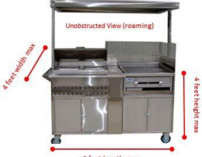
6 feet length max

b. All roaming sidewalk vendors must maintain an unobstructed view over 4 feet in height from the ground to the tabletop structure of their sidewalk vending equipment, as illustrated by the example below: